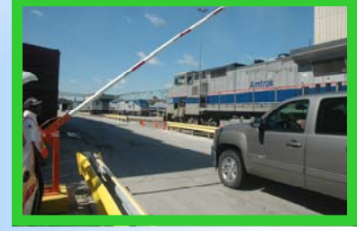
Security at rail yard exit