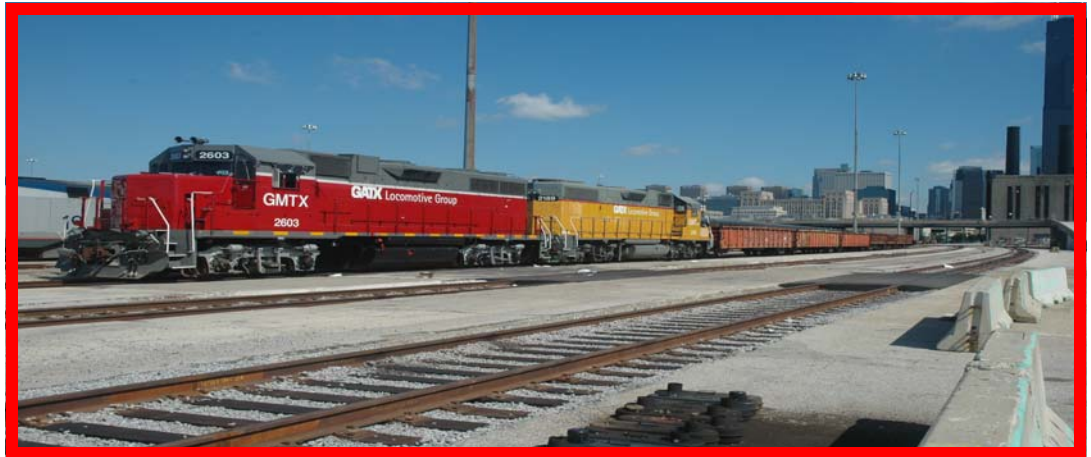
Rail Yard Security: A nationwide rail line is among a number of new clients of Allpoints Security and Detective, Inc.