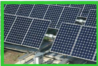
A close-up view reveals rows of solar energy capturing cells