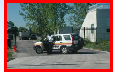
Vigilant Allpoints Security Officer protects the assets of Chicago's first solar-panel park