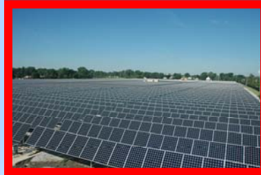
Acres of solar-panels populate a portion of a solar park Client