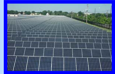
Uniformly distributed panels convert solar energy into electricity