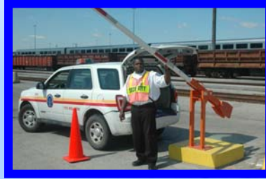
APSD Security Officer on guard