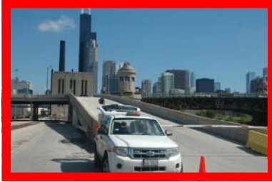
Entrance to rail yard