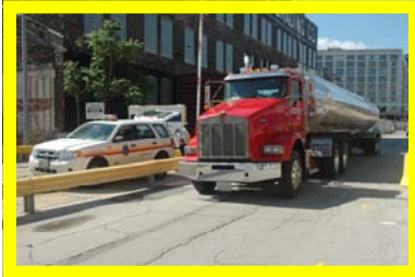
Busy yard requires a close watch