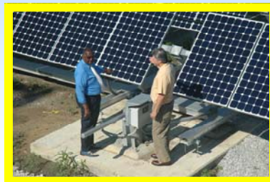
Allpoints management confers with solar-panel park management on security tactics